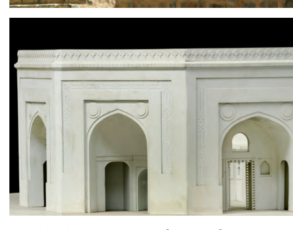
(Top) Plan with Condition Assessment of the Tomb of Mirza Muzaffar Hussain; (Centre) Restoration works on Chota Batashewala Mahal as per the evidences, archival images found, and (Bottom) architectural models created to understand the structure in detail.