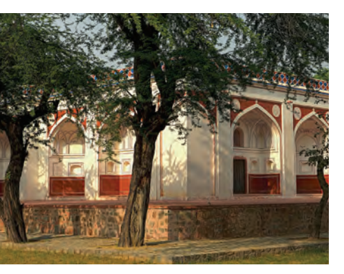
(Top) Following the land transfer to the ASI, over 150 structures built in this complex over the last 25 years were demolished thus revealing enclosure walls and restoring the historic character; (Centre) Before & After conservation views of the internal chambers of Mirza Muzaffar Hussain's Tomb after the restoration of missing geometric patterns in incised plasterwork on the interior wall and roof surfaces; (Bottom) Restored Tomb of Mirza Muzaffar Hussain with its garden setting.