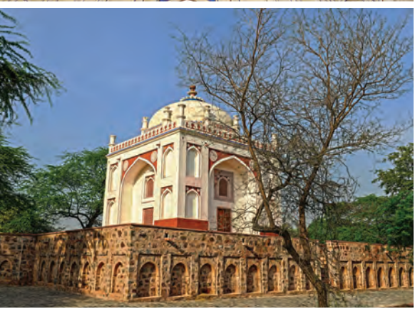
(Top) Finial elements found during conservation works were put back; (Centre) Restoration of ornamented interiors, in which much of the ornamentation had been lost due to neglect, water seepage and inappropriate past repairs wherein plain cement plaster was used on wall and ceiling surfaces that were originally decorated; (Bottom) Mughal Tomb after completion of conservation works and garden restored.