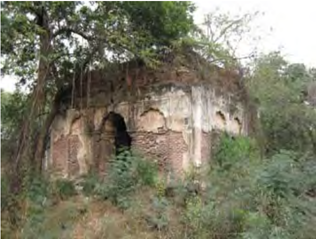
Garden Pavilion in 2008 before conservation