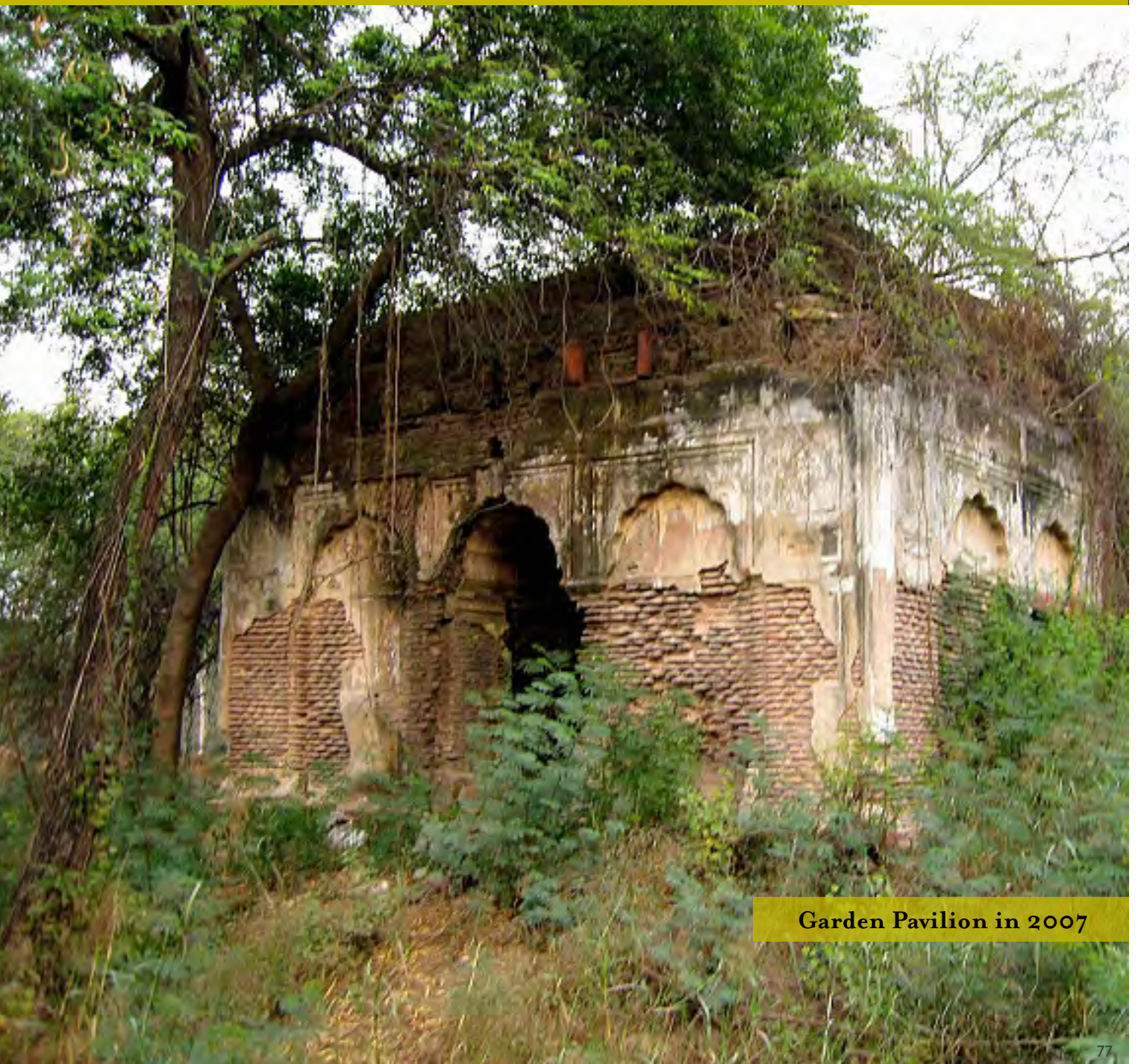
Garden Pavilion in 2007