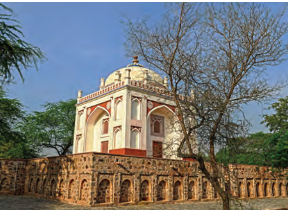
(Top) Finial elements found during conservation works were put back; (Centre) Restoration of ornamented interiors, in which much of the ornamentation had been lost due to neglect, water seepage and inappropriate past repairs wherein plain cement plaster was used on wall and ceiling surfaces that were originally decorated; (Bottom) Mughal Tomb after completion of conservation works and garden restored.