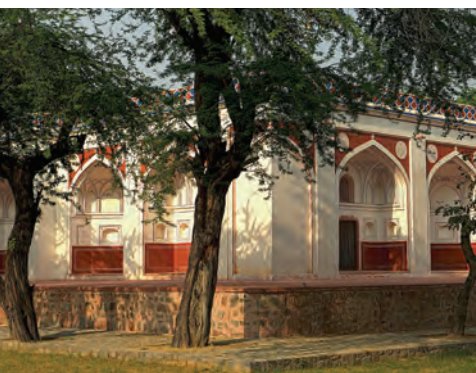
(Top) Following the land transfer to the ASI, over 150 structures built in this complex over the last 25 years were demolished thus revealing enclosure walls and restoring the historic character; (Centre) Before & After conservation views of the internal chambers of Mirza Muzaffar Hussain's Tomb after the restoration of missing geometric patterns in incised plasterwork on the interior wall and roof surfaces; (Bottom) Restored Tomb of Mirza Muzaffar Hussain with its garden setting.