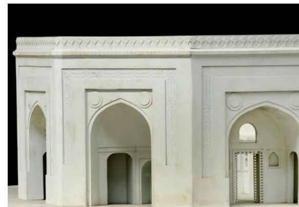
(Top) Plan with Condition Assessment of the Tomb of Mirza Muzaffar Hussain; (Centre) Restoration works on Chota Batashewala Mahal as per the evidences, archival images found, and (Bottom) architectural models created to understand the structure in detail.