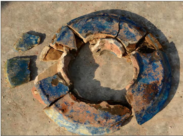
(Left) A ceramic tile finial was found under the cement plaster on the dome. This will be displayed at the proposed Humayun's Tomb Site Museum.