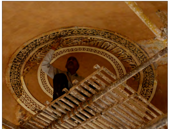
(Top Left) Barakhamba DDA Park in 2011, before the landscape development; (Top Right) Conservation works on the monument; (Below Left) Landscaping development in progress, with craftsmen carrying the stone blocks required for landscape works; (Below Right) Restoration of internal ceiling