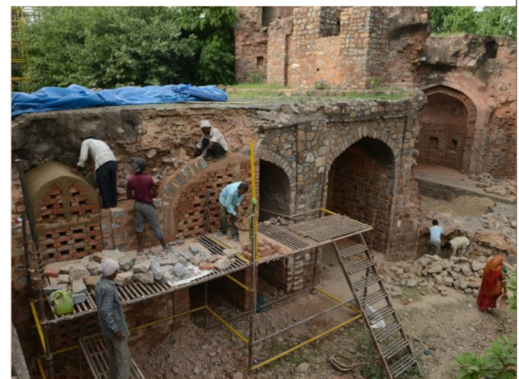
Picture showing conservation works on the gateway

HUMAYUN'S TOMB SUNDER NURSERY NIZAMUDDIN BASTI