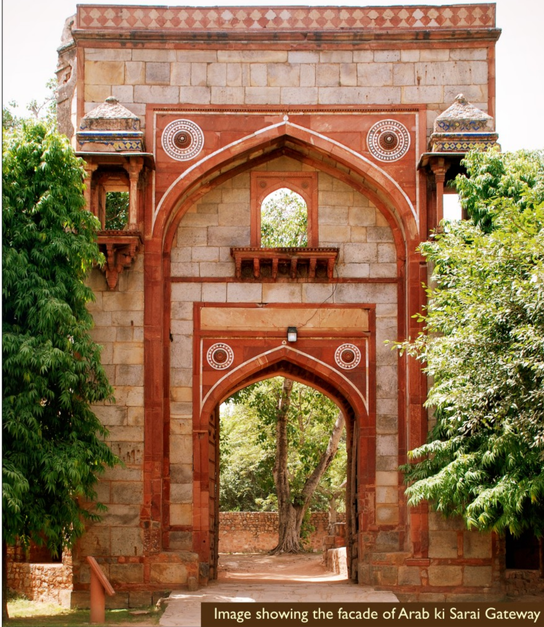
Image showing the facade of Arab ki Sarai Gateway

This 48 Feet high gateway served as the southern entrance of the Arab Sarai - built to accommodate the Persian craftsmen involved in the building of Humayun's garden-tomb. Major portion of the Arab Sarai is today the Industrial Training Institute and is inaccessible to visitors.