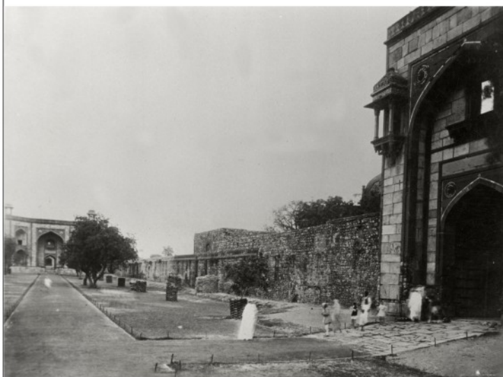
Archival image of Arab ki Sarai Gateway